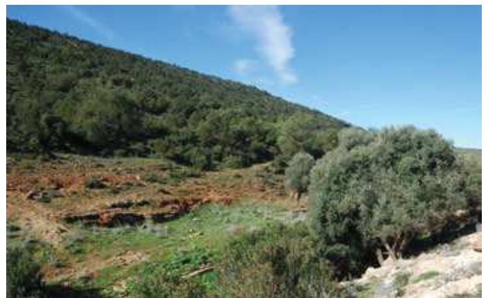
Figure 2: Habitat of Salamandra algira spelaea in Beni Snassen Massif.

From this starting point we began to monitor this population, which has been extended for a period of five years. The working methodology was to perform visual encounter surveys in suitable habitats for reproduction, in this case water bodies, as this species is ovoviviparous (1). This monitoring has confirmed that the species is found in low densities and occupies a very restricted area in the Beni Snassen mountains. Beni Snassen's fire salamanders inhabit subhumid forest biomes, consisting of evergreen oaks, Sictus trees and Aleppo pines (Fig. 3); although they also occur in traditional agricultural fields, such as orchards, where it can survive if suitable breeding habitats are available. However, during our surveys in 2011 and 2013, we have witnessed the loss of at least two peripheral breeding sites. These sites were altered by local people, preventing