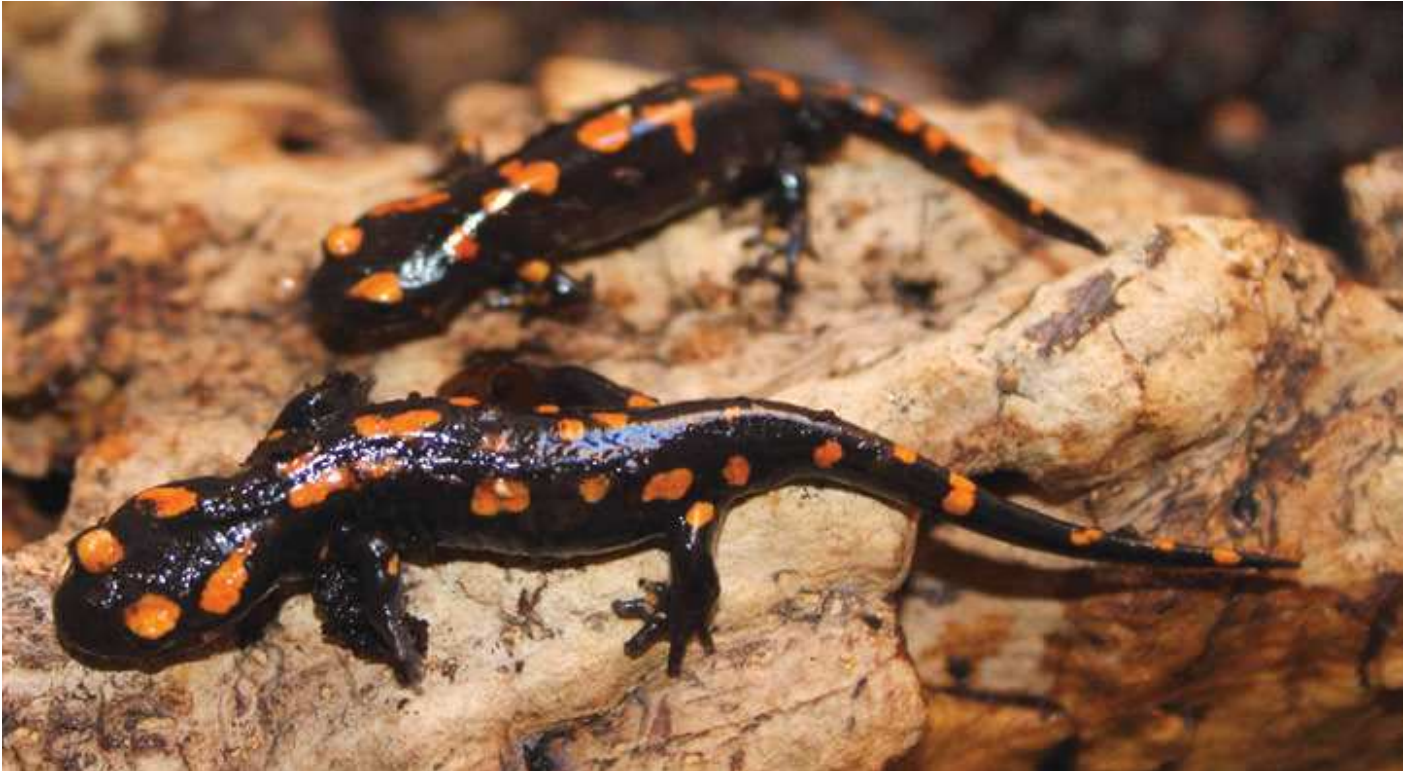
Figure 3: Juveniles of Salamandra algira spelaea .

access to water of adult females, who could not deposit their larvae in the water. Considering the limited range of this salamander, the loss of these peripheral populations is very detrimental, limiting its ability to expand its range into other favorable areas. Other factors threatening the species are degradation of the forest, due to overgrazing and fires. Particularly in the Beni Snassen's, given the prevalent semiarid conditions, deforestation is very negative for the remaining populations of salamanders, since this loss of vegetation cover is strongly related to a decrease in humidity. The combined effect of the fragmentation of the forest and the scarcity of suitable sites for reproduction could have disastrous consequences on the long-term survival of Beni Snassen's fire salamanders. Appropriate protective measures must be undertaken as quickly as possible to ensure the survival of this interesting endemic. These measures should go through the integral protection of the remaining patches of forest and construction of fountains and watering holes suitable for the reproduction of this species. Similar management has proven to be effective for the protection of species of amphibians in semiarid environments such as Alytes dickhilleni , in the