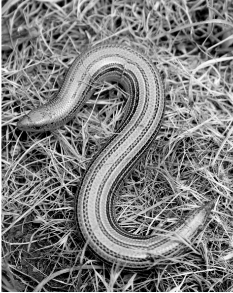
Fig. 2: Image of the studied Chalcides specimen found in the Théniet El Had National Park, Algeria.